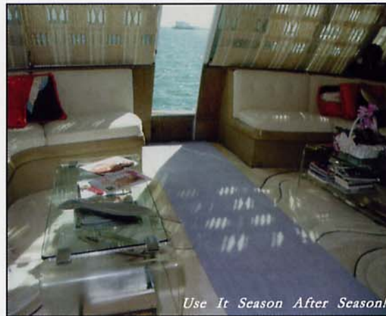
Use It Season After Season!

Keep your RV looking new! Perfect protection from the elements. Soft, attractive & easily cut to fit any area. Stows compactly.